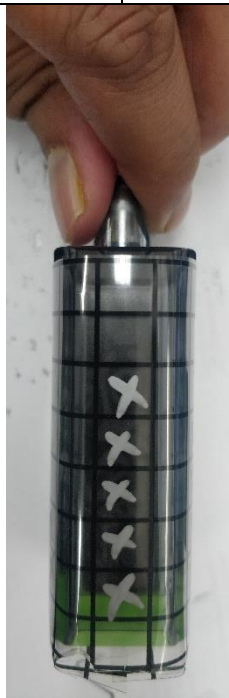
Right side view