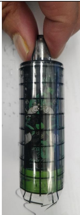
Left side view